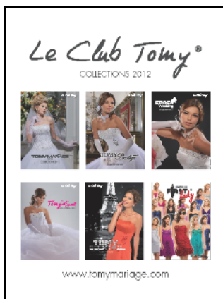
Le Club Tomy Collections 2012