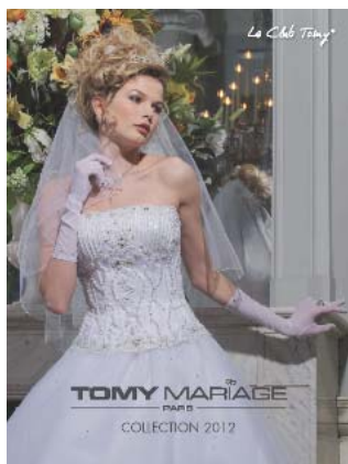
TOMY MARIAGE COLLECTION 2012