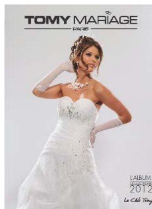
TOMY MARIAGE L'ALBUM COLLECTIONS 2012